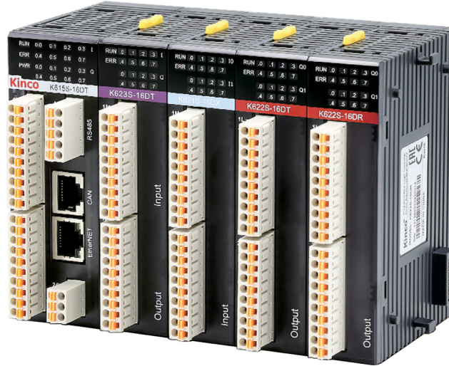
(Example of Expansion Modules Connected Together)